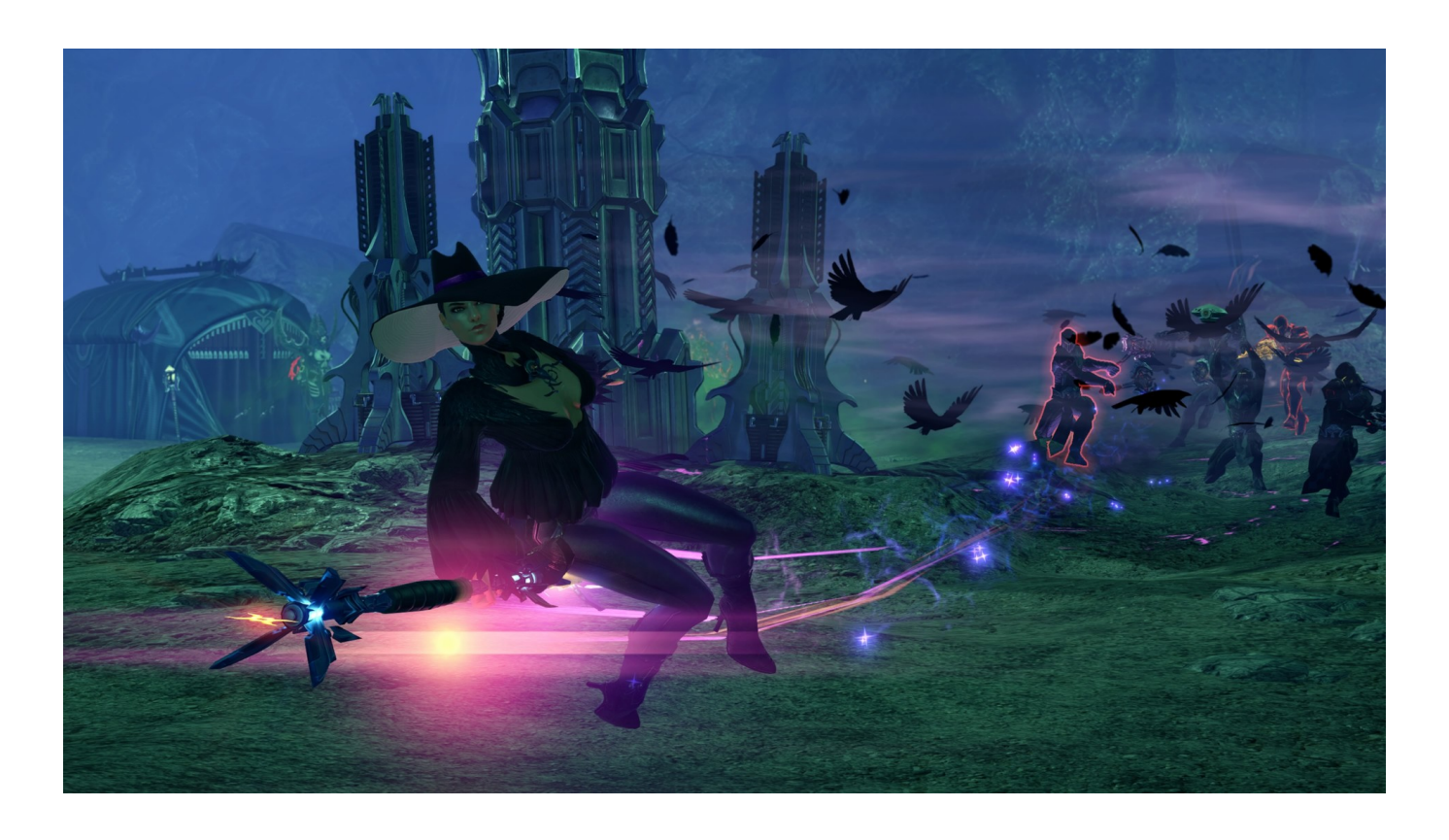
Skyforge - Class Booster Pack Download Lite